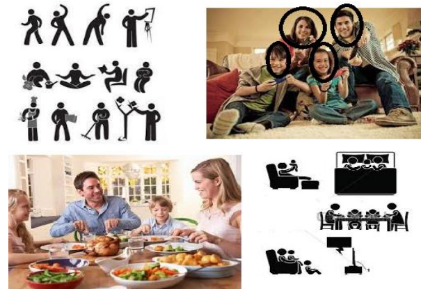
Fig 2: Example of daily human activities

Especially in the context of home automation, human activity identification provides important information in the process of analyzing the contextual information of inhabitants and then proposing the suitable actions to be proposed or executed.